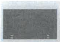
24" Over The Range Microwave Haier HMV1472BHS