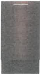
18" Dishwasher (Panel Ready) UDTS18SAHP