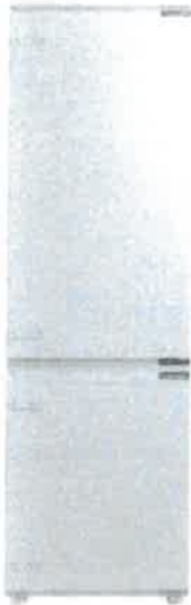
24" Fridge (Panel Ready) GE - M2E9FPMKII