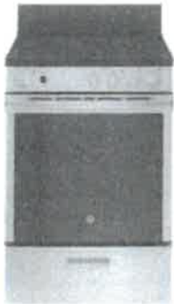
24" Range, Smooth top GE – JCAS640RMSS