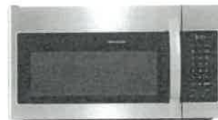
30" Over The Range Microwave Frigidaire FFMV1846VS