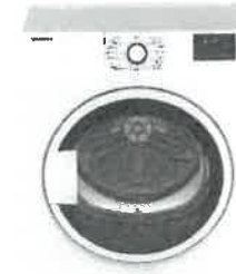
24" Dryer DV7600WW