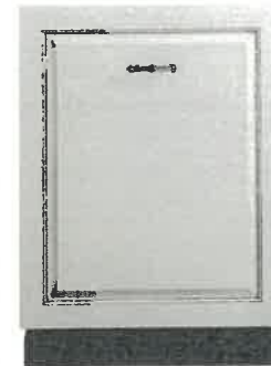
24" Dishwasher (Panel Ready) GBT412SIM1