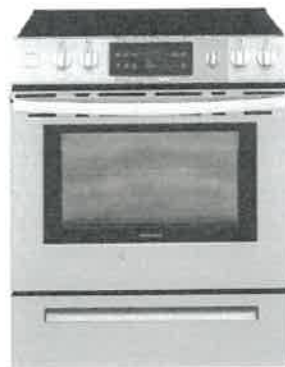
30" Range, Smooth top Frigidaire CFEH3054U