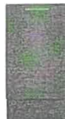
(Panel Ready) UDT518SAHP