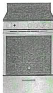
24" Range, Smooth top GE - JCAS640RMSS