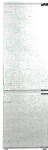
24" Fridge (Panel Ready) GE - M2E9FPMKII