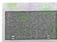
24" Over The Range Microwave Haier HMV1472BHS