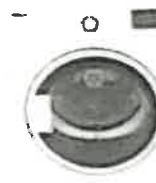
24" Dryer DV7600WW

Products photos may not be exact and are subject to change without notice with equal or better value E & O E.