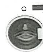
24" Washer WM7200WW