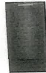
(Panel Ready) UDT518SAHP