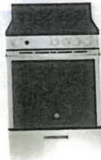
24" Range, Smooth top GE - JCAS640RMSS