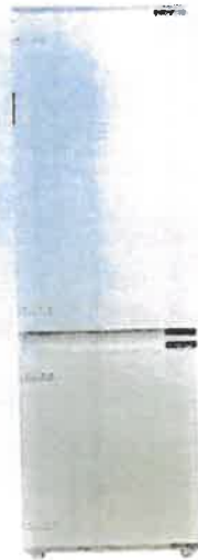
24" Fridge (Panel Ready) GE - M2E9FPMKII