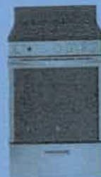
24" Range, Smooth top GE - JCA5640RMSS