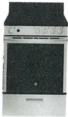
24" Range, Smooth top GE - JCAS640RMSS