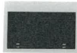
24" Over The Range Microwave Haier HMV1472BHS