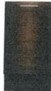
(Panel Ready) UDT518SAHP