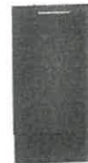
(Panel Ready) UDT518SAHP