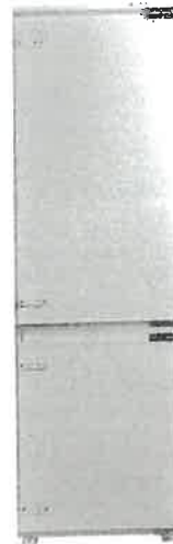
24" Fridge (Panel Ready) GE - M2E9FPMKII

PURCHASER NAME JAWED PIYARALI PURCHASER NAME ALEEZA JAWED AJ DATE June 17, 2022