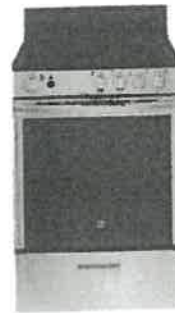
24" Range, Smooth top GE - JCA5640RMSS