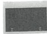
24" Over The Range Microwave Haier HMV1472BHS