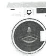
24" Washer WM7200WW