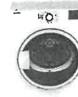
24" Dryer DV7600WW

Products photos may not be exact and are subject to change without notice with equal or better value. E & O.E.