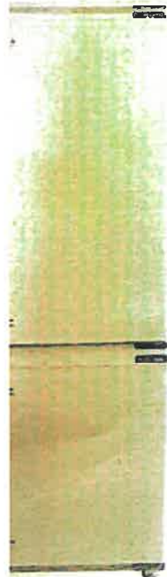
24" Fridge (Panel Ready) - M2E9FPMKII