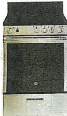
24" Range, Smooth top GE - JCA5640RMSS