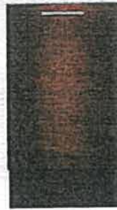
24" Dishwasher (Panel Ready) UDT518SAHP