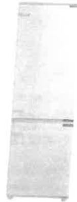
24" Fridge (Panel Ready) GE M2E9FPMKII

PURCHASER NAME Balpreet Grewal PURCHASER INITIAL BG DATE Dec 19/22