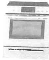
30" Range, Smooth top Frigidaire CFEH30S4U