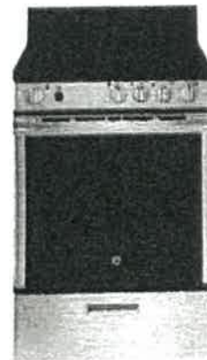
24" Range, Smooth top GE - JCA5640RMSS