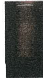
(Panel Ready) UDT518SAHP