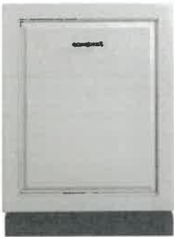
24" Dishwasher (Panel Ready) GBT412SIM1