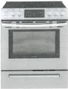
30" Range, Smooth top Frigidaire CFEH3054U