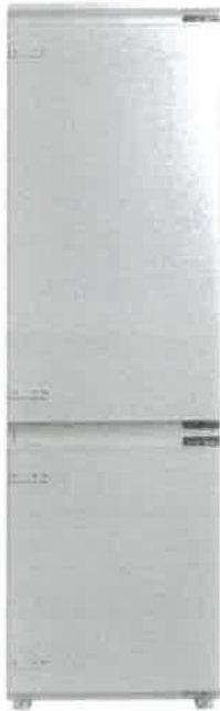
24" Fridge (Panel Ready) GE - M2E9FPMKII