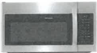
30" Over The Range Microwave Frigidaire FFMV1846VS