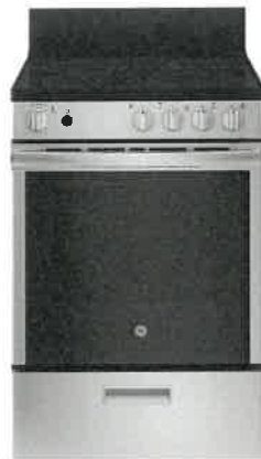
24" Range, Smooth top GE – JCAS640RMSS