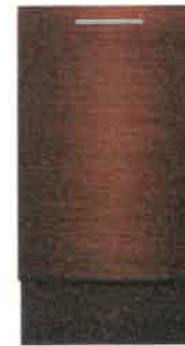
(Panel Ready) UDT518SAHP 18" Dishwasher