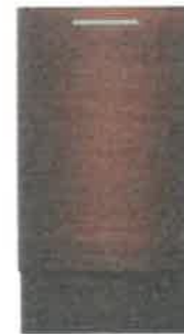
18" Dishwasher (Panel Ready) UDT518SAHP