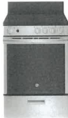
24" Range, Smooth top GE - JCAS640RMSS