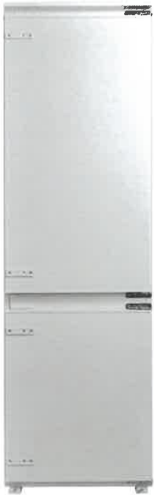
24" Fridge (Panel Ready) GE - M2E9FPMKII