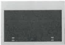
24" Over The Range Microwave Haier HMV1472BHS