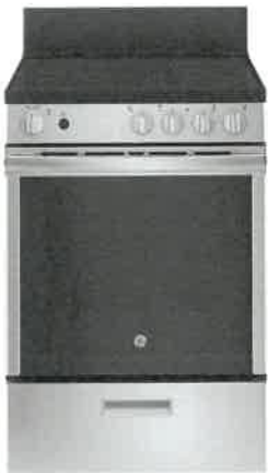
24" Range, Smooth top GE – JCA5640RMSS