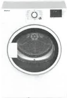
24" Dryer DV7600WW