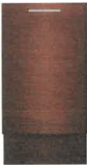
18" Dishwasher (Panel Ready) UDT518SAHP