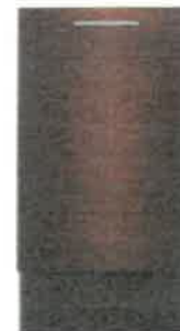
18" Dishwasher (Panel Ready) UDT518SAHP