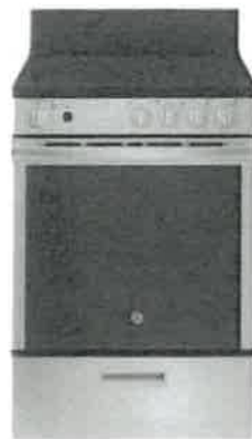
24" Range, Smooth top GE – JCA5640RMSS