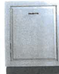
24" Dishwasher (Panel Ready) GBT412SIM1