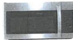
30" Over The Range Microwave Frigidaire FFMV1846VS