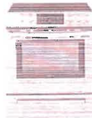
30" Range, Smooth top Frigidaire CFFH30S4U