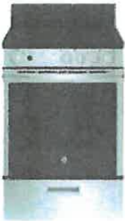
24" Range, Smooth top GE - JCA5640RMSS