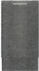
18" Dishwasher (Panel Ready) UDT518SAHP