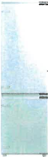
24" Fridge (Panel Ready) GE - M2E9FPMKH