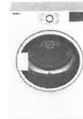
24" Dryer DV7600WW

Products photos may not be exact and are subject to change without notice with equal or better value. E & O.E.