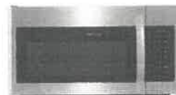
30" Over The Range Microwave Frigidaire FFMV1846VS