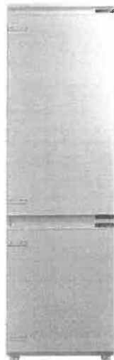
24" Fridge (Panel Ready) GE - M2E9FPMKII