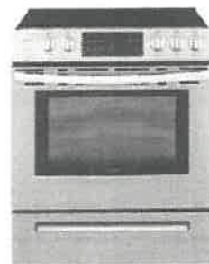
30" Range, Smooth top Frigidaire CFEH3054U