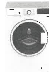
24" Washer WM7200WW