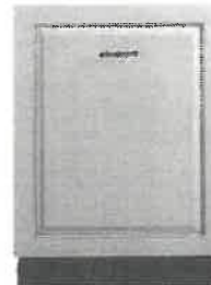
24" Dishwasher (Panel Ready) GBT412SIM1