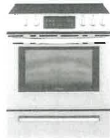
30" Range, Smooth top Frigidaire CFEH3054U