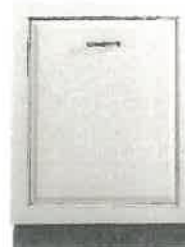
24" Dishwasher (Panel Ready) GBT412SIM1