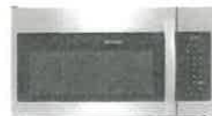
30" Over The Range Microwave Frigidaire FFMV1846VS