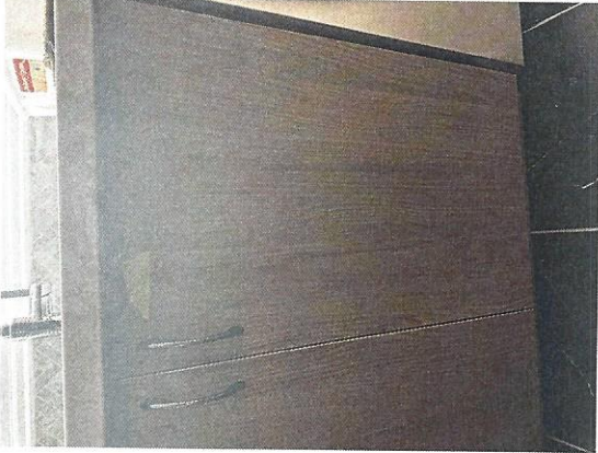
171348 - 1 - 20231222_141703 - the countertop company damaged one of the gables in the master ensuite